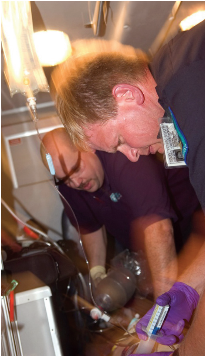
Research in resiliency training has shown successful readjustment diminishes the risk of developing posttraumatic stress disorder.

from 1990–2010, researchers reviewed 1,787 deaths of active and retired Chicago Fire Department (CFD) members, identifying 41 completed suicides. Each death was a male with an average age of 55. In addition, researchers determined the likelihood of an active or retired CFD member committing suicide was 25 times greater than the general population (10–12 suicides per 100,000 in general population versus 25 suicides/10,000 for the CFD cohort). 1 Further, work-related stress has been associated with mental health problems and the prevalence of posttraumatic stress disorder (PTSD) appears to be much higher than for the general population. Some startling data suggests that first responders live 15 years less than the “civilian world.”